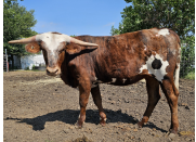
DB Jammin' Span

TTT: 47.7500 on 09/20/2024 Weight: 745.0000 on 09/20/2024